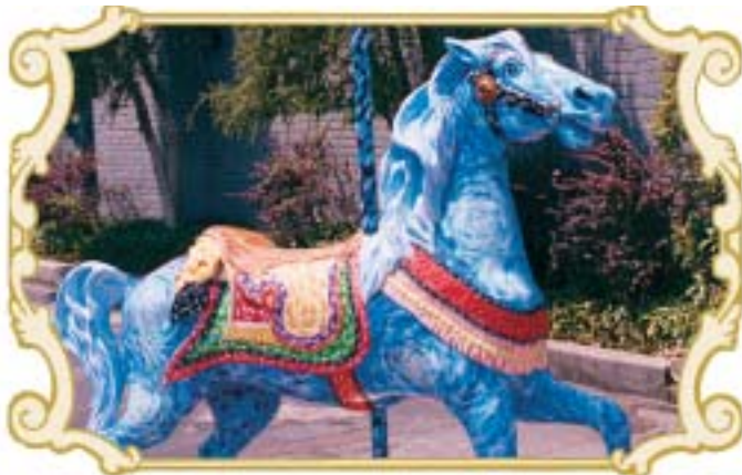
Opposite page: "Fair Filly"; above: "Racing for Hope"; left: "Giddy Up Van Gogh"