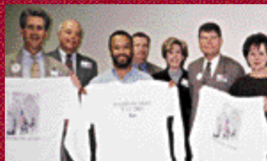
Volunteers from Rush Foundation Hospital