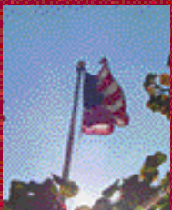
Doughboy Monument Flag