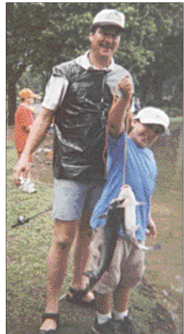
The Highland Park pool, top, is a popular spot for swim meets. Above, a youngster shows off his catch at the First Annual Fishing Rodeo

Children who are physically or mentally challenged have the opportunity to participate in events like Camp High Hopes—which includes arts and crafts, games, swimming and story telling—and the Challenger League softball program, modified to allow the kids to be involved in athletics.