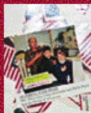
Oakland Heights Elementary